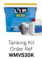
Tanking Kit Order Ref WMVS30K