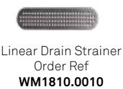
Linear Drain Strainer Order Ref WM1810.0010