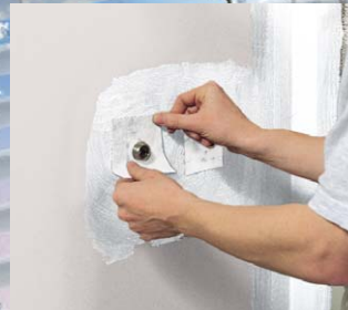
It is very important that the area around the pipes is 100% waterproof as water might run backwards along the pipe into the wall.