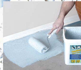
Tanking with LIP VS 30 is easy. 2 layers must be applied to achieve a thickness of 1 mm.