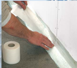
Reinforcement is fixed with LIP VS 30.

Apply 2 coats of LIP VS 30 to achieve a 1 mm coat. The room can be tiled after the waterproofing membrane is fully dry approx 12- 24 hrs. We suggest the use of LIP Flexible Tile adhesive for your tiling.