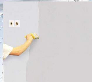
All walls and floor must be primed before tanking.