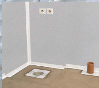
After sealing all joints, corners, pipes ect: the room is ready for priming.