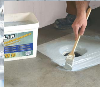
Depending on the type of drainage make sure that all sides are reinforced.